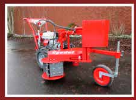
BASAL PRUNER 400-500 TREES/HOUR!