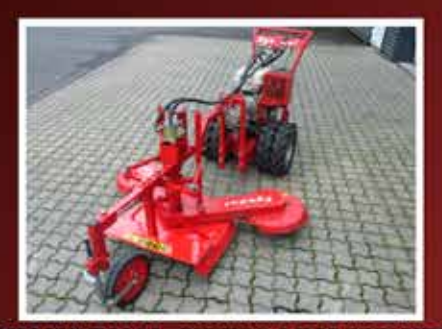
E9H W/ DUAL SWINGARM MOWER MORE ATTACHEMENTS AVAILABLE!