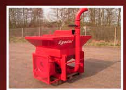
AIRFLOW FERTILIZER SPREADER 65 FT SPREADING WIDTH!