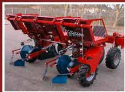
TYPE K TRANSPLANTER 1,2 & 3 ROW AVAILABLE! GPS CAPABLE!