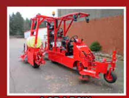
2 OR 3 ROW GANTRY TRACTOR MOW, SPRAY, BASAL PRUNE, AND MORE!