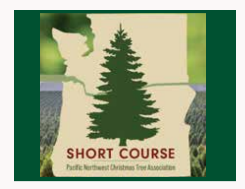
February 2026 Short Course Sheraton Portland Airport Hotel Portland, Oregon