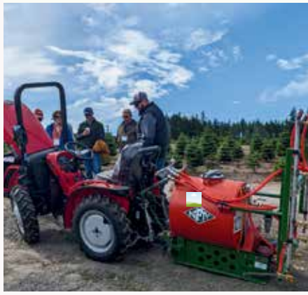
August 14-16, 2025 Christmas Tree & Farm Showcase Combined Summer Farm Tour and Tree Fair & Tradeshow Event! Estacada, Oregon