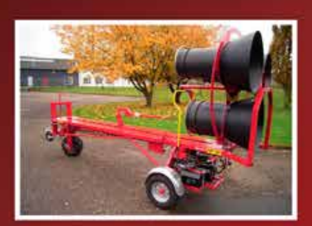
SELF-PROPELLED MESH TREE BALER 3-4 SECONDS PER TREE!

CUSTOM-DESIGNED AND BUILT FOR CHRISTMAS TREE GROWERS!