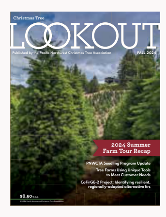
June 6 Closing date for advertising space reservations for Summer Lookout magazine.