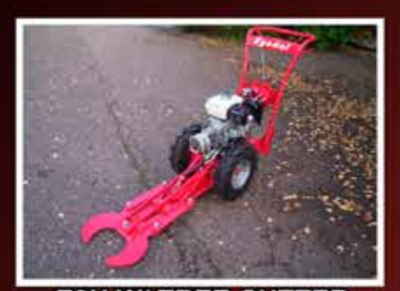
E9H W/ TREE CUTTER HARVEST UP TO 400 TREES/HOUR!